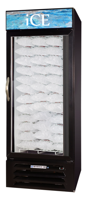
MMF27-1-B-ICE (SHOWN IN BLACK EXTERIOR) White finish available

MODELS: MMF27-1-B-ICE MMF27-1-W-ICE MMF27-1-B-ICE-LED MMF27-1-W-ICE-LED